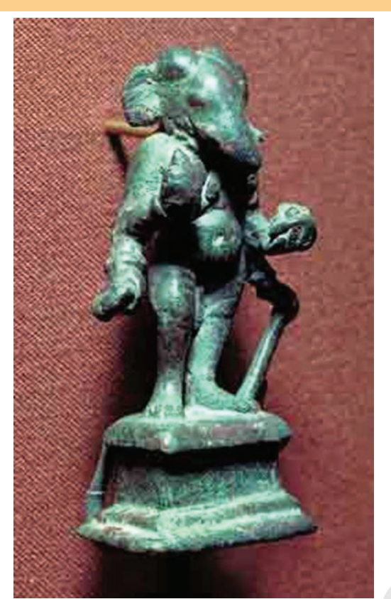
Ganesh, Kashmir, seventh century CE

Andhra Pradesh in the third century CE and at the same time there is a significant change in the draping style of the monk's robe. Buddha's right hand in abhaya mudra is free so that the drapery clings to the right side of the body contour. The result is a continuous flowing line on this side of the figure. At the level of the ankles of the Buddha figure the drapery makes a conspicuous curvilinear turn, as it is held by the left hand.