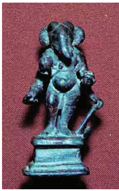
Ganesh, seventh century CE, Kashmir