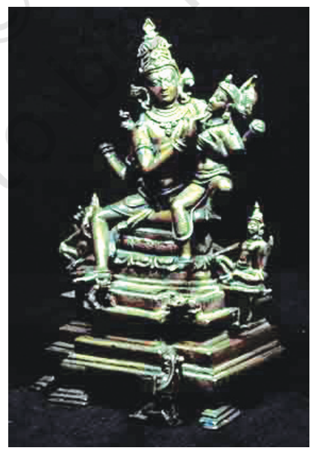
Shiva Family, tenth century CE, Bihar

Many standing Buddha images with right hand in abhaya mudra were cast in North India, particularly Uttar Pradesh and Bihar, during the Gupta and Post-Gupta periods, i.e., between the fifth, sixth and seventh centuries. The sanghati or the monk's robe is wrapped to cover the shoulders which turns over the right arm, while the other