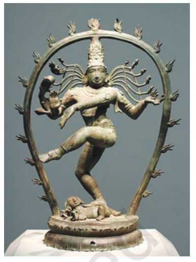
Nataraja, Chola period, twelfth century CE

The bronze casting technique and making of bronze images of traditional icons reached a high stage of development in South India during the medieval period. Although bronze images were modelled and cast during the Pallava Period in the eighth and ninth centuries, some of the most beautiful and exquisite statues were produced during the Chola Period in Tamil Nadu from the tenth to the twelfth century. The technique and art of fashioning bronze images is still skillfully practised in South India, particularly in Kumbakonam. The distinguished patron