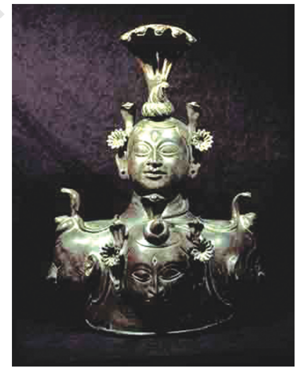
Bronze sculpture, Himachal Pradesh

A noteworthy development is the growth of different types of iconography of Vishnu images. Four-headed Vishnu, also known as Chaturanana or Vaikuntha Vishnu , was worshipped in these regions. While the central face represents Vasudeva,