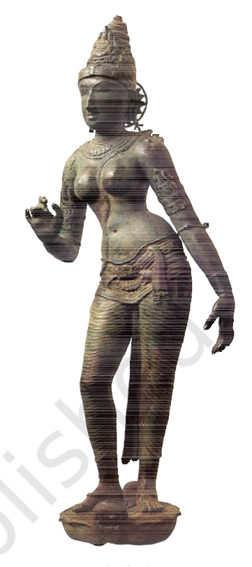
Devi, Chola bronze, Tamil Nadu

The image is now covered with a thick coating of paste, made of equal parts of clay, sand and cow-dung. Into an opening on one side, a clay pot is fixed. In this molten metal is poured. The weight of the metal to be used is ten times that of wax. (The wax is weighed before starting the entire process.) This metal is largely scrap metal from broken pots and pans. While the molten metal is poured in the clay pot, the clay-plastered model is exposed to firing. As the wax inside melts, the metal flows down the channel and takes on the shape of the wax image. The firing process is carried out almost like a religious ritual and all the steps take place in dead silence. The image is later chiselled with files to smoothen it and give it a finish. Casting a bronze image is a painstaking task and demands a high degree of skill. Sometimes an alloy of five metals gold, silver, copper, brass and lead — is used to cast bronze images.